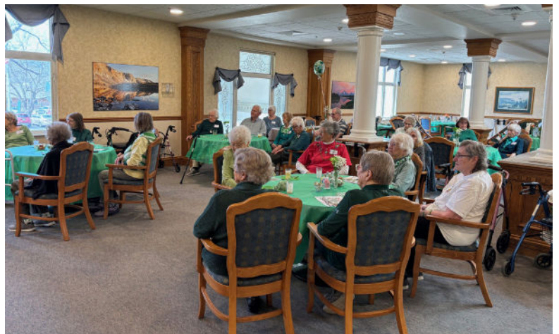
St Patricks Day gathering.