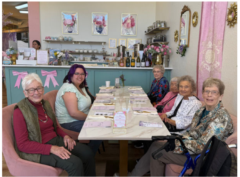
A visit to The Duchess Tea Room.