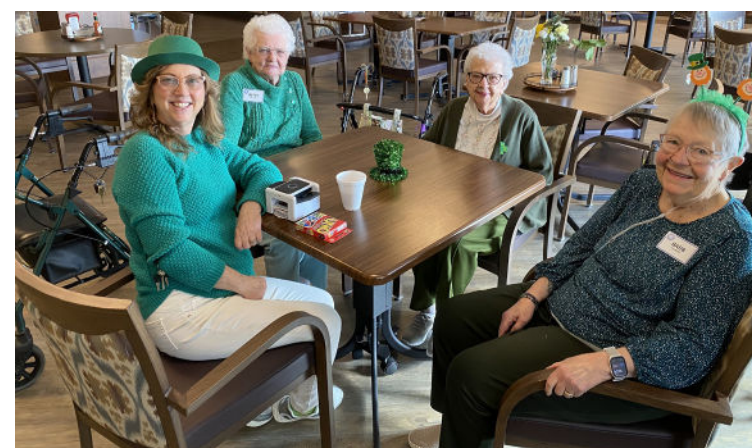
Lots of partying for St. Patrick's Day.