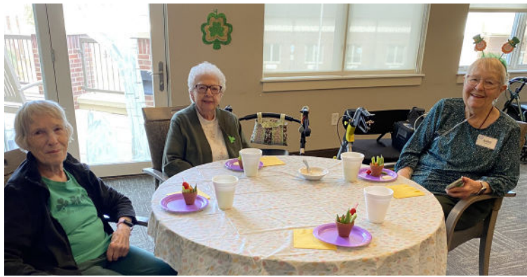
Welcoming Spring at The Windsor.