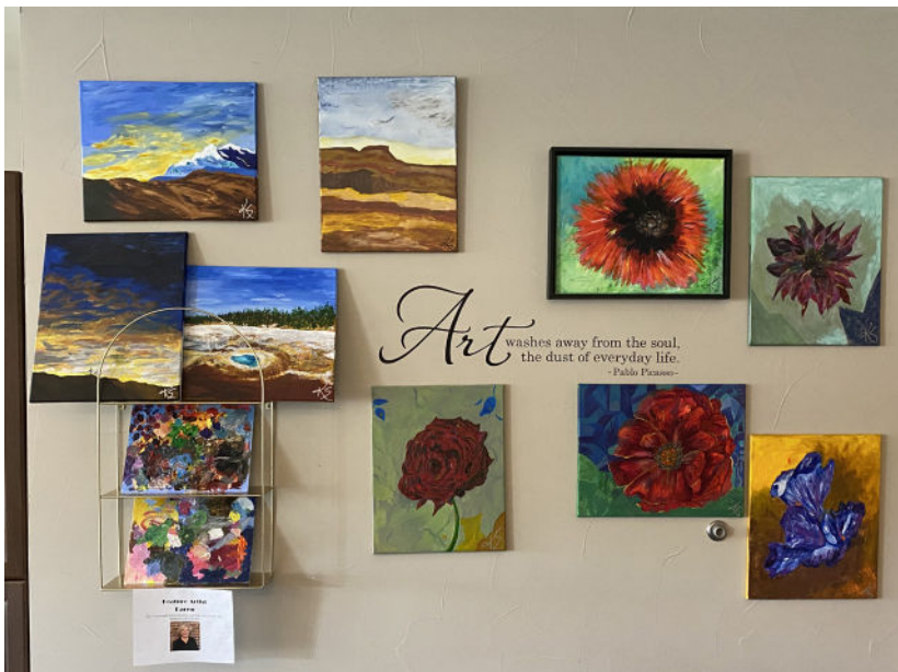
Wow, incredible new artist!