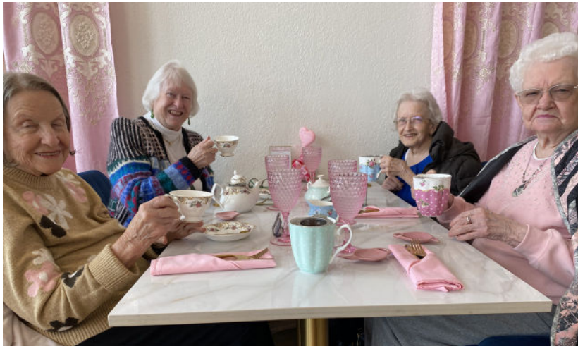
Out for tea with the ladies.

Please note that all visitors entering The Windsor will be asked to sign in at the Front Desk .