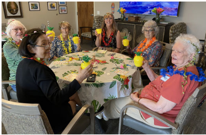
Enjoying experiencing Hawaiian culture