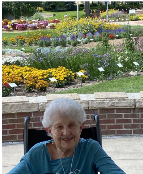
Visiting the CSU Flower Gardens