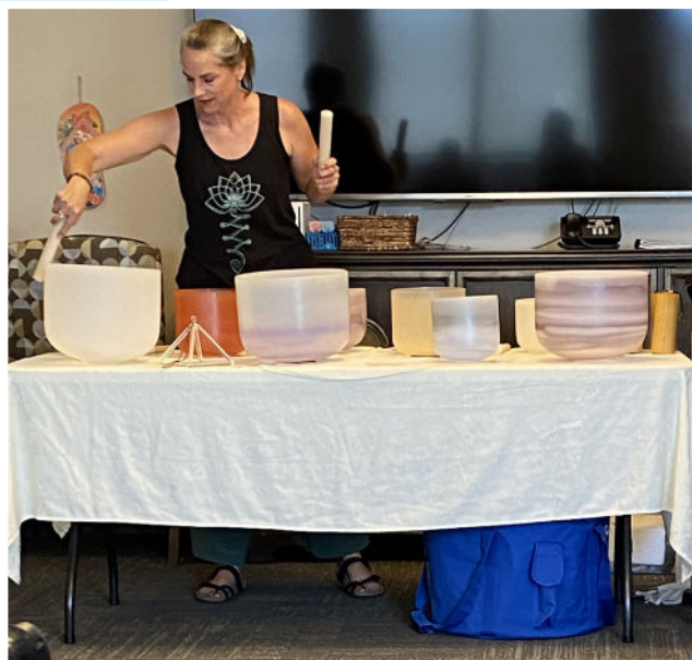
Music Bowls were interesting