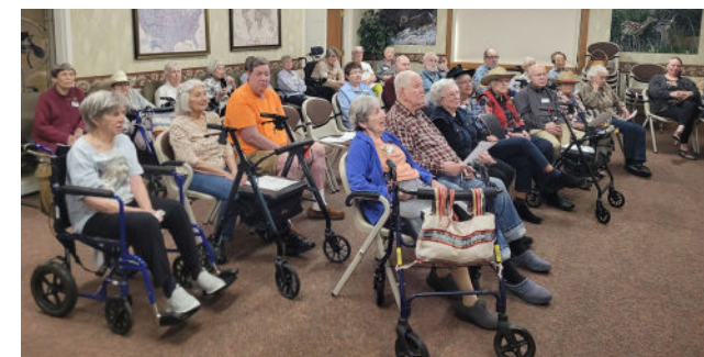
Winslow - Western Singers