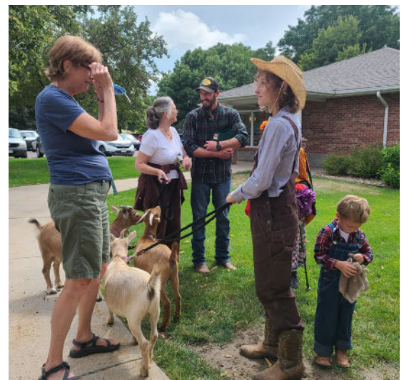
Horan Ranch brought the cutest goats to visit!