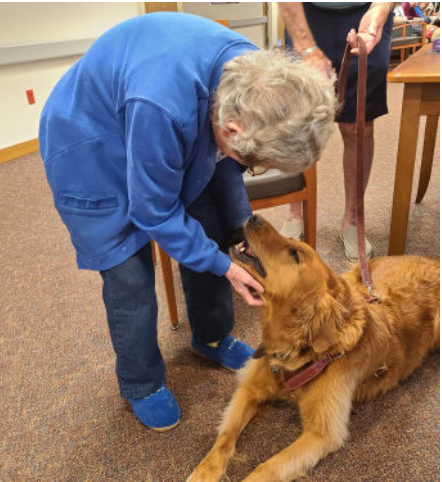
Residents love Arnold Palmer, one of our Pet Therapy Pups!

Furry friends make our days brighter, no doubt. We’re offering our residents’ group therapy sessions every week with some amazing pups! Join us for a doggone good time.