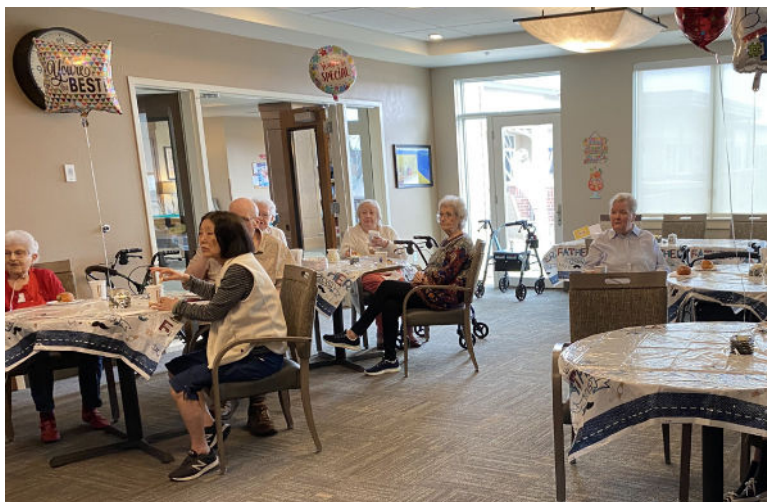
Father's Day Celebration.