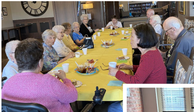
Lunch bunch outings are the best!