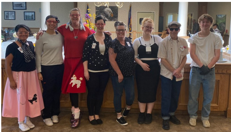
50s dress up day.