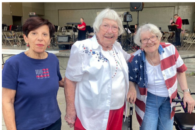
Loveland concert band.