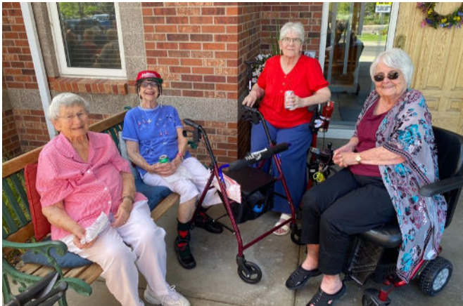
4th of July Party.

Do your hearing aids need to be cleaned or repaired? Connect Hearing is offering monthly hearing aid clinics for Wexford residents. Services include cleanings and minor repairs in house. The location of these clinics are to be determined. This month’s clinic is Wednesday, August 20th at 3:00 p.m. in the private dining room.