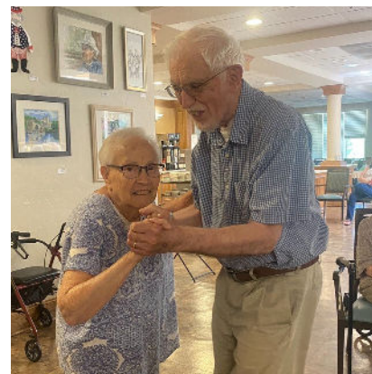
Happy hour dancing.