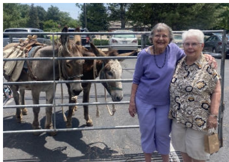
Summer social - Donkeys.