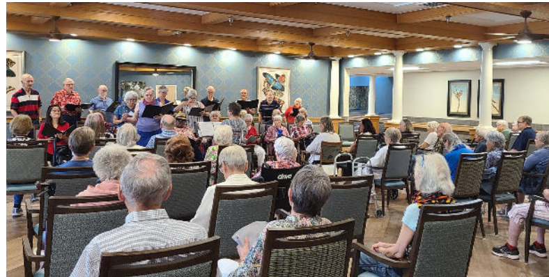
Senior Serenaders singing patriotic songs for our residents for the 4th!