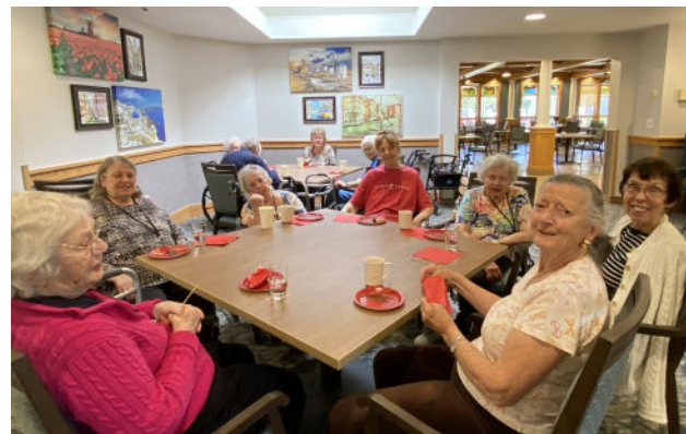
Residents are all smiles for our Chocolate Covered Treats event for World Chocolate Day.