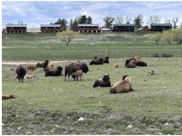
Terry Buffalo Ranch Fun!