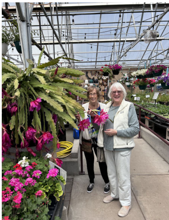
High Hops amazing flowers.