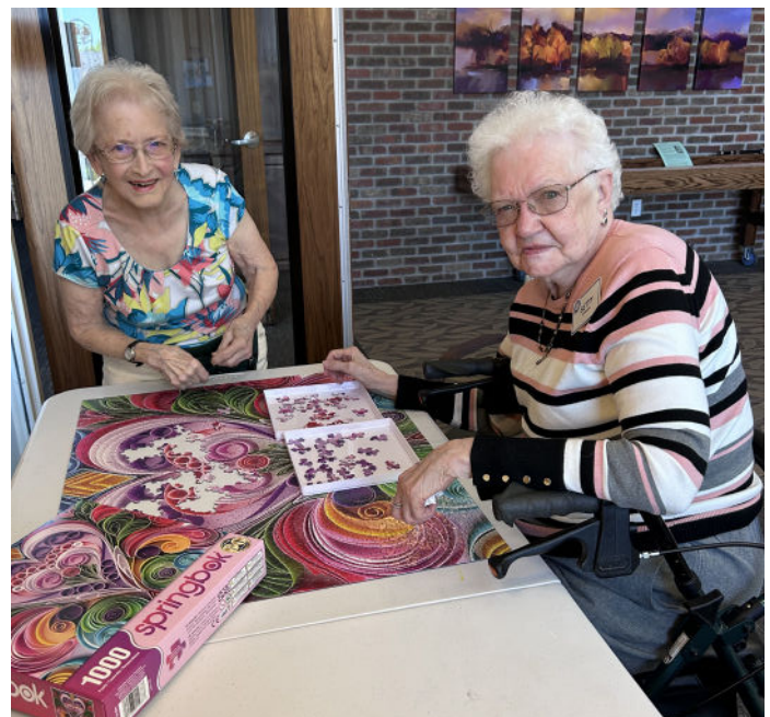
1000 piece puzzle isn't for sissies