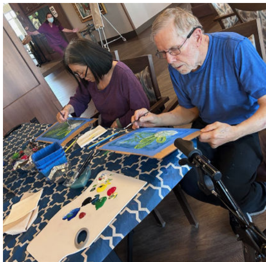
Artists at The Windsor.