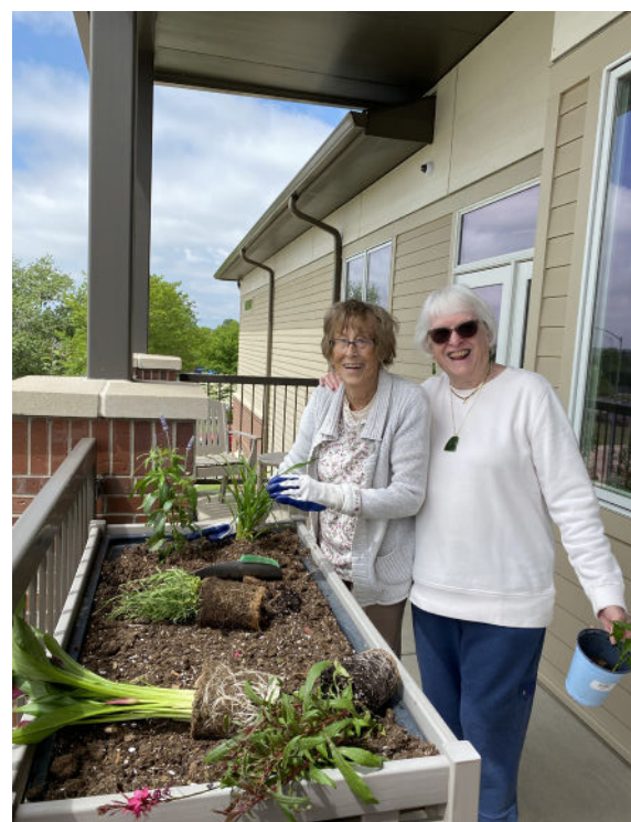
Gardener's to the rescue.