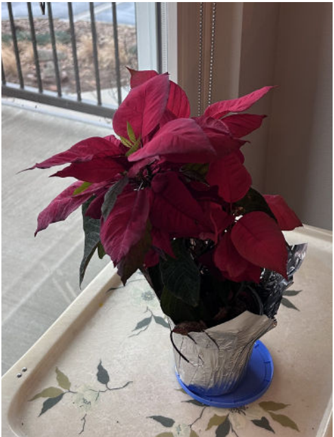
Residents blooming flowers. Is that a poinsettia?

*please sign up at the front desk for podiatry and audiology