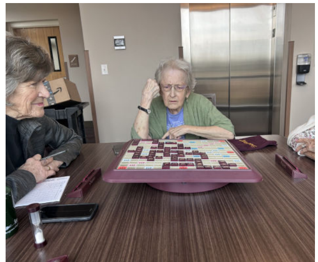
Ladies enjoying scrabble.