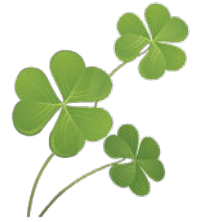
Holiday Parties at The Windsor.