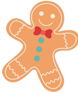
NMC Senior Serenader's spreading Christmas cheer!