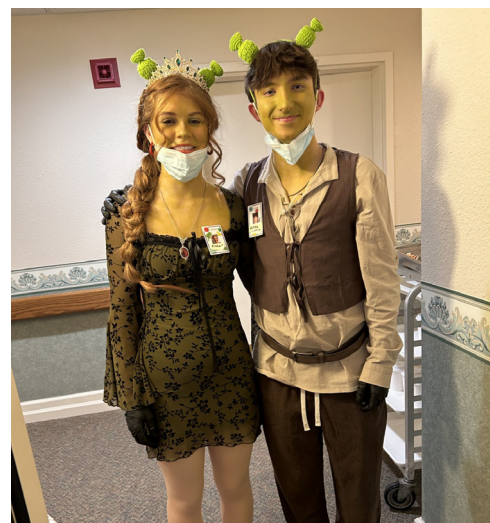
Waitstaff dress up for Halloween.