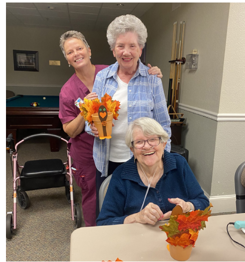
Making fall crafts.