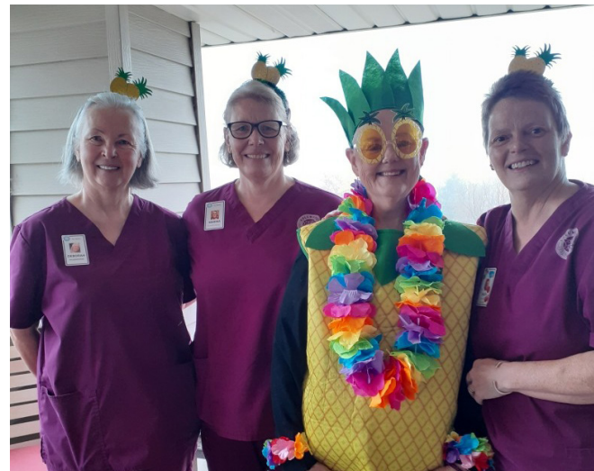
Housekeeping dressed up for Halloween.