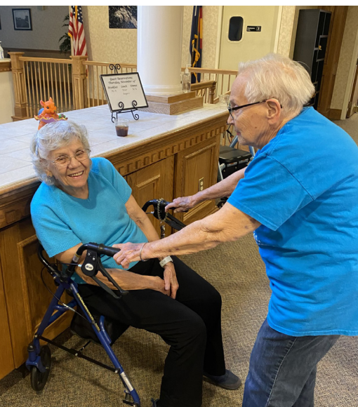
Dancing during Happy Hour.