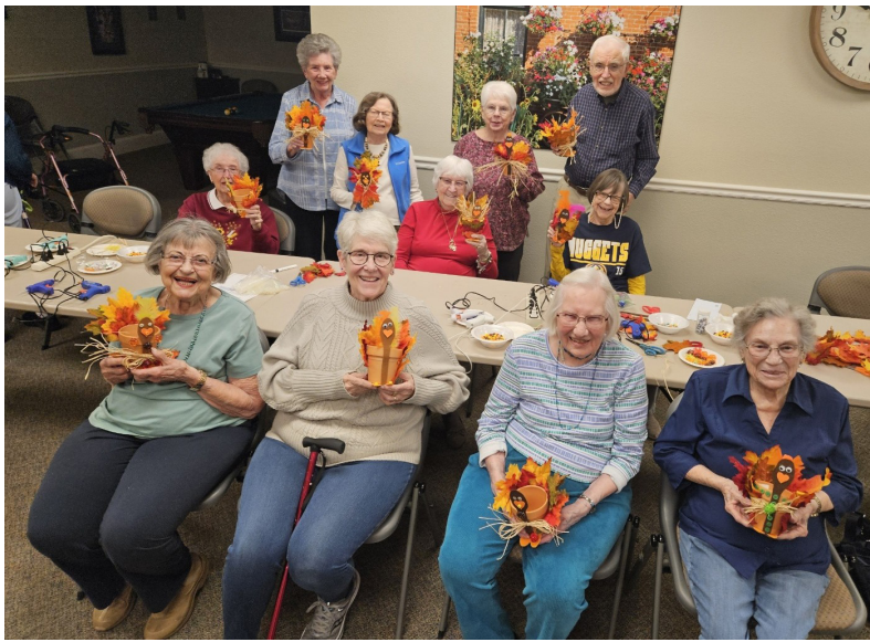
Residents show off their fall crafts.