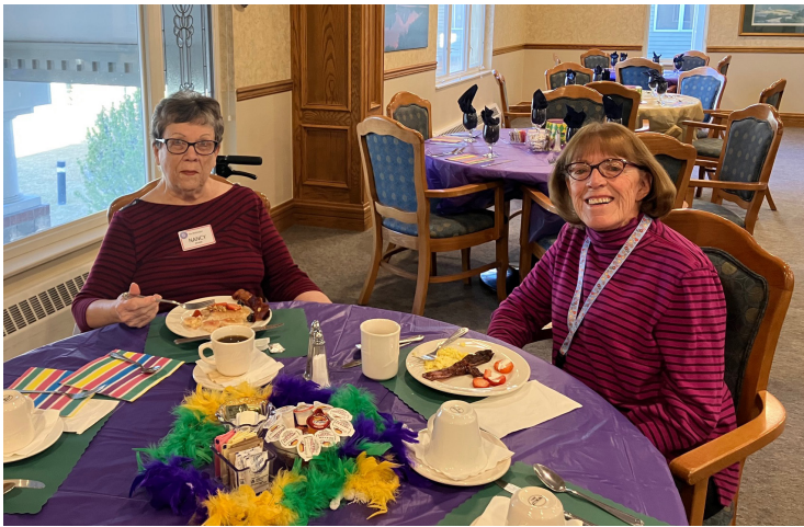
Fat Tuesday fun.