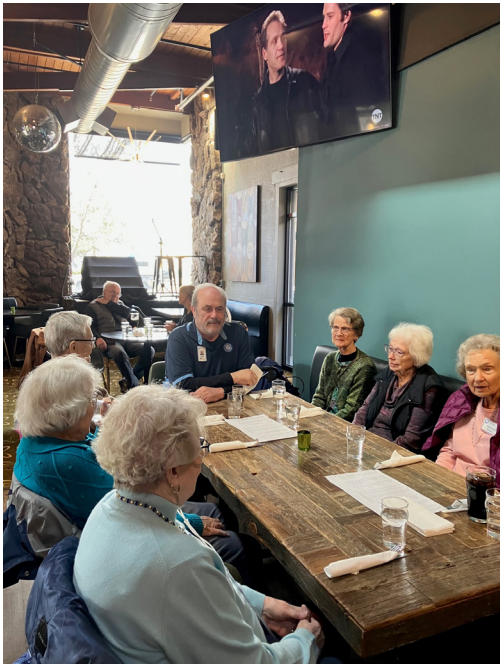
Out to lunch.