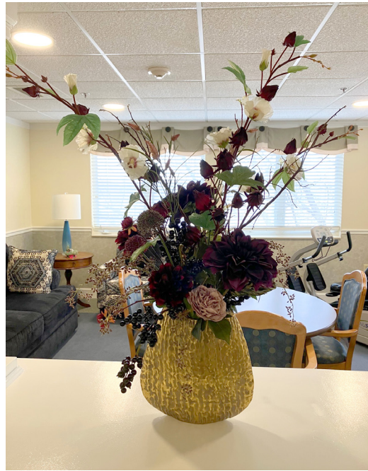
Resident bought arrangement for 3rd floor lounge.