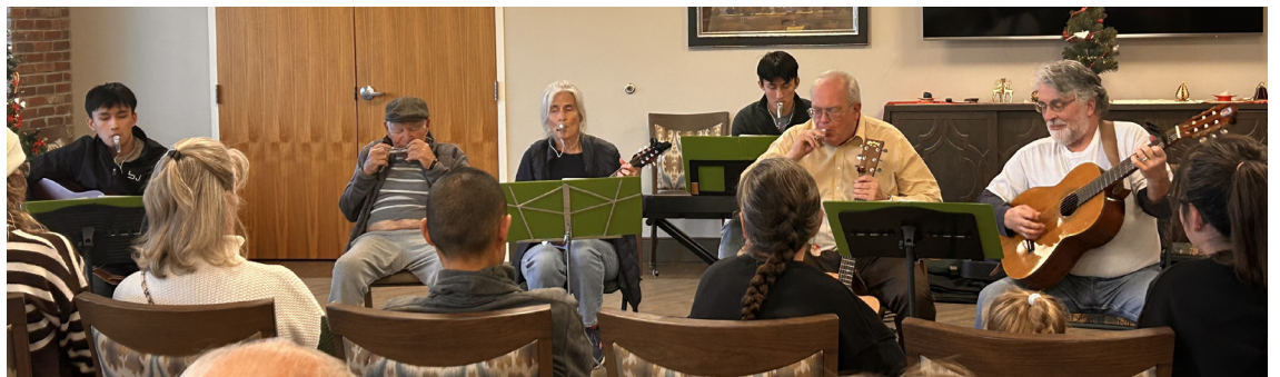
Greeley Senior Citizen Singers are the best!