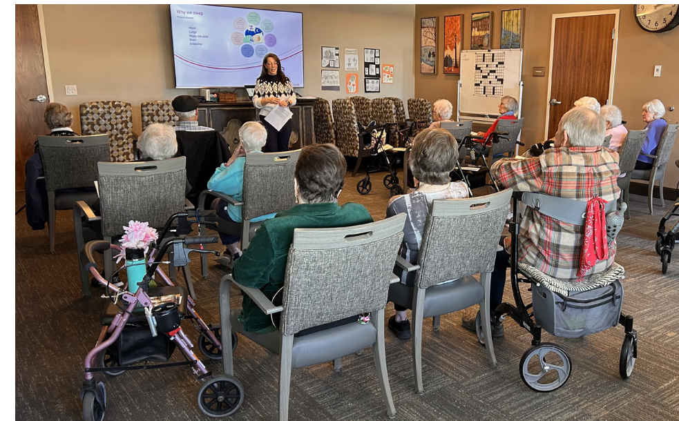
Sleep strategies Presentation