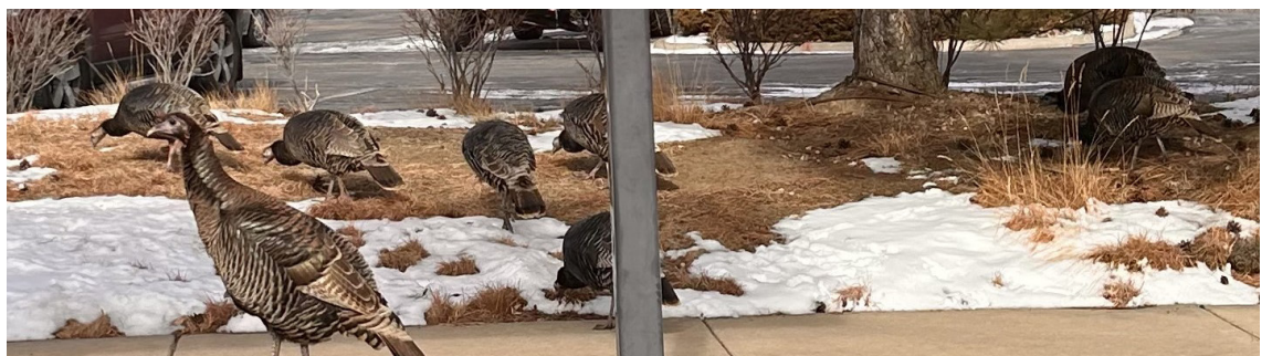
We saw turkeys trying to catch the bus on our outing