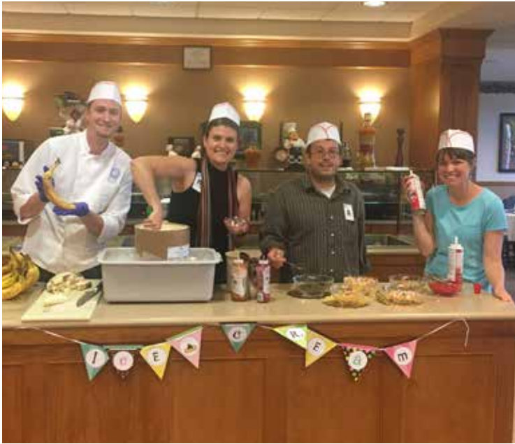
Winslow team making banana splits