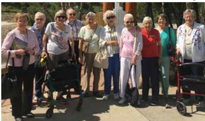
Hwy 34 Scenic Drive trip

Reminder: Please make beauty salon appointments at least one week in advance.