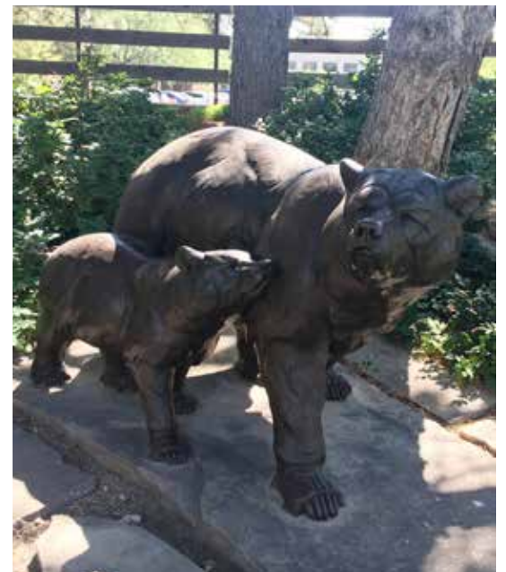
Leanin' Tree Western Art Museum

Tickets have been purchased and transportation arranged for a day out at Coors Field. If you need to cancel your reservation or want to be added to the wait list, please see Keri in Activities. Let's hear it for the Colorado Rockies!