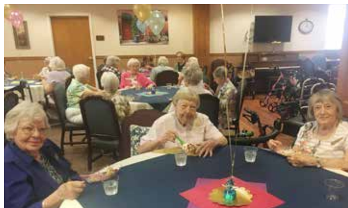
Golden 90s Banana Split Party

Trees command attention; birds sing for attention; butterflies dance for attention; wildflowers blossom for attention; mushrooms tease for attention. The diversity of wildlife can distract the eager wildlife enthusiast and thereby obstruct the achieving of personal ambitions. This becomes the naturalist's quest: discern your interest.